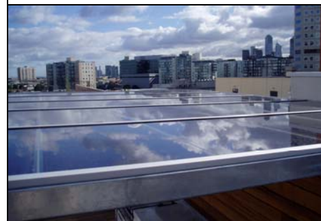
Top of the Solar Pergola