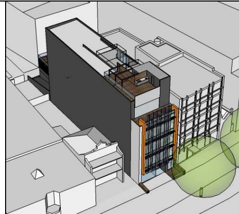
40 Albert Road showing rooftop 1