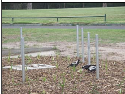
Ground above the installed water storage tank with stakes to restrict traffic.