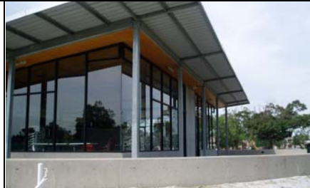
Bren's Pavilion – bar area

The solar hot water panels are located on the north-facing sloping roof, placed in a position that minimised their visual impact. The storage tanks are located in the plant room in the centre of the building. The hot water is pumped from the panels to the storage tanks. Once the storage tanks reach their maximum temperature, the pump switches off and the panels re-radiate any unwanted heat. The pump is also activated on very cold nights to protect the solar collector panels from frost by circulating warm water through the system.