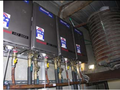
The instantaneous gas boosting bank and existing header tank.