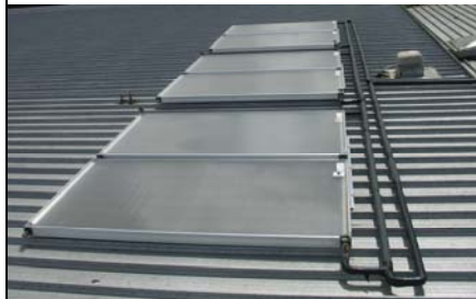
The solar hot water panels.