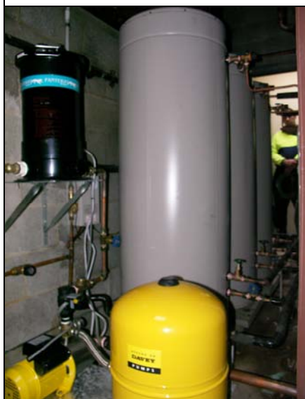
The pumps & storage tanks.