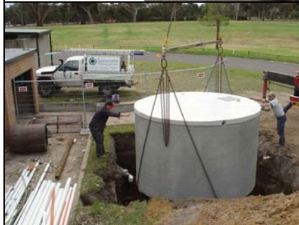
The underground water storage tank being placed into position.