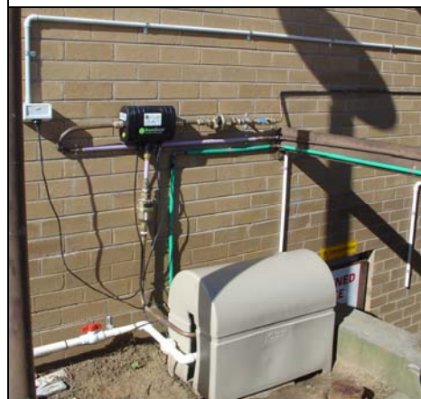
Rainbank & Pump Housing