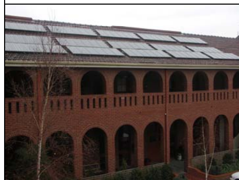
Roof Mounted PV Panels