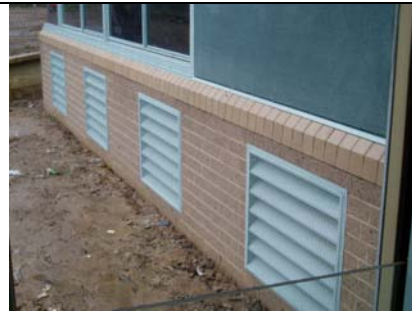
The outside fresh air intake located low down on the south side of the building.