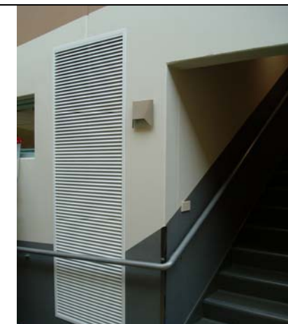
The lower air register inside the solar chimney.