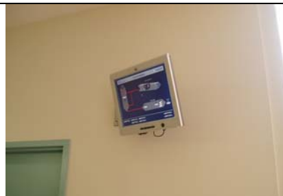
Wall mounted monitor display.