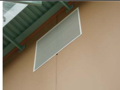
The upper air register inside the solar chimney.