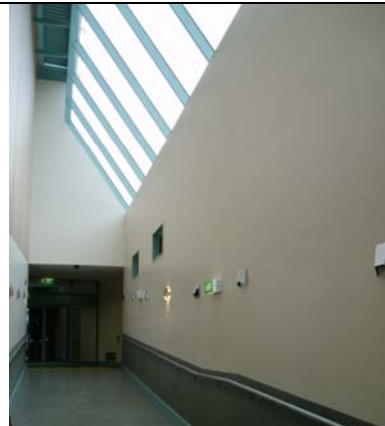
Inside the solar chimney.