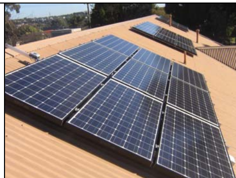
PV Panels on Roof