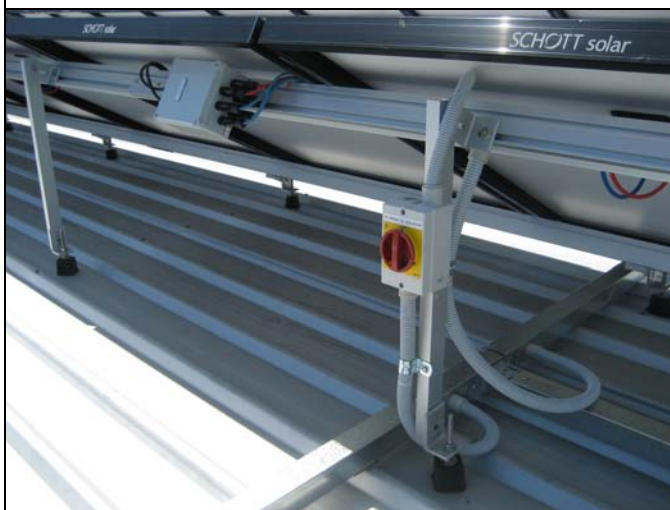
Left: Back of Panels, Mounting Frame, String Fusing Box, DC Isolator & Cable Conduit