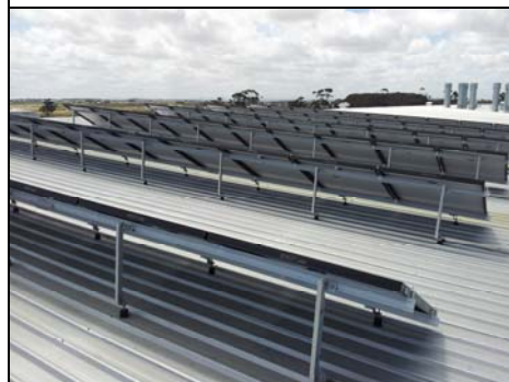
Framing Support Rails