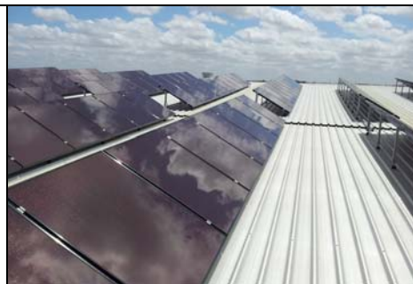
PV Panels on Roof