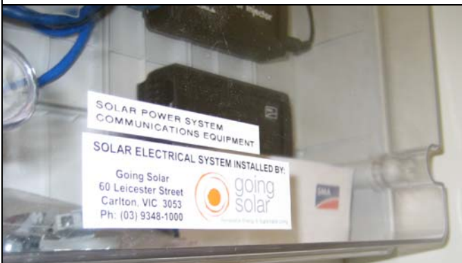
Above: Communications Equipment Right: Safety Signage