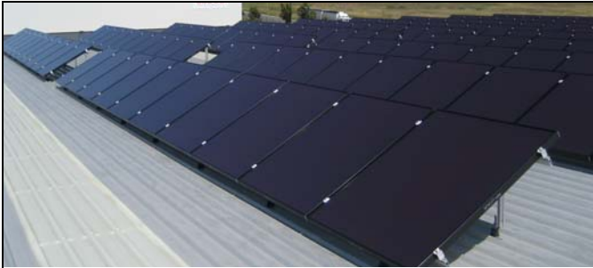
Left & Right: Schott Thin Film Solar Panels