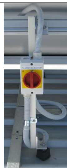
Right: Detail of DC Isolator and Cable Conduit