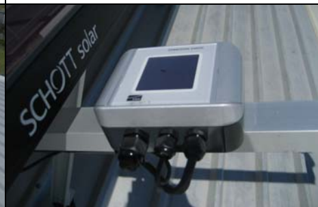
Above: Ambient Data Centre Left: Wind Anemometer