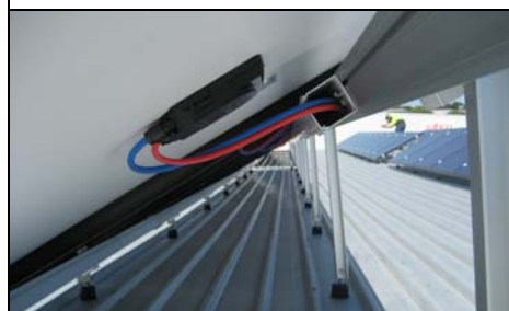
Frame Support and Cable Conduit