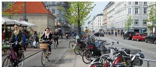
Separated Cycle Lane in Copenhagen

Ref: Christopher Hume, Toronto Star, 4/9/09