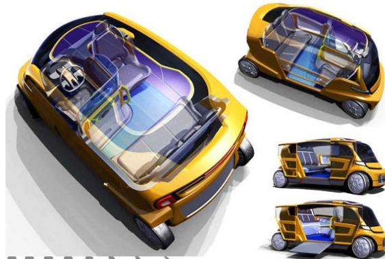
New York Taxi UniCab Photo

friendly. In fact, the UniCab name is inspired by the notion of access for everyone. It has been designed with a low, flat floor-pan and a sliding wheelchair access ramp. The concept's designers say