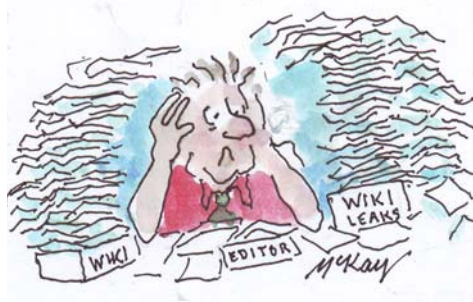
The New Environmental Hazard