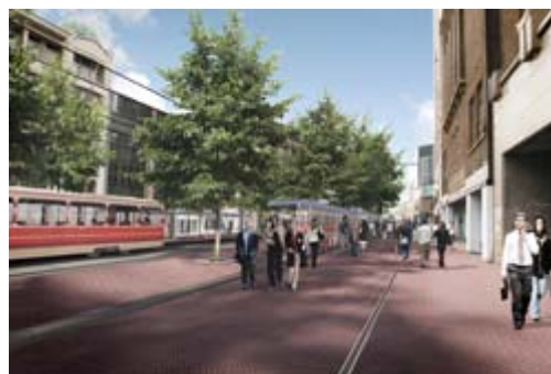
Spui from the Hofweg

“Work on the Spui’s new design in The Hague’s city centre has now been officially completed. The street had to be redesigned as a result of the Traffic Circulation Plan (VCP). The Spui and