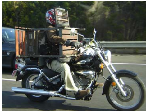
Australia Day Weekend BBQ Eastern Freeway, Melbourne, Speed 100kph Photo Ref: CGU Safety & Risk Team, 27/1/08