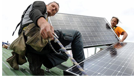
Going Solar installers with safety harnesses Photo: Jon Hargest Sunday Herald Sun, 4/6/11